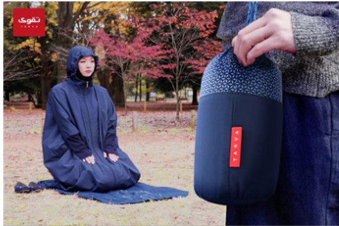
Figure 2. The versatile prayer attire for travel by Prayer Parka.

A variety of functional clothing products are available in the market such as protective clothing, medical clothing or sports clothing, even though little information is available regarding the principles employed in these products. The multifunctional garment arose to fill some wanted requirements in the new lifestyles and "many designers of super modern clothing have adopted a modular system of dressing in an attempt to simplify the complexities and unify the discontinuities of life (Morais, 2015). The design research has to attend with product multifunctional ability includes adjustable, mobility, donning and doffing, safety and flexibility. Functional considerations are concerned with a product's ability to perform the tasks required by the user. While functional clothes specially designed for people with disabilities can benefit other people too. For example, in figure 2, the existing brands which are making multifunctional Muslim prayer attire based on user's needs.